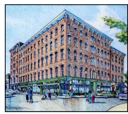
Conceptual Drawing of Rehabilitated Wauregan Hotel

necticut Trust, the Connecticut Historical Commission, the Norwich Heritage Trust and others to try to change public opinion about the building and encourage the City to give Becker & Becker an opportunity to present their proposal for reusing the building. The plan calls for a mix of low- and moderate-income apartments with commercial space on the street level and a fully restored grand ballroom for public functions.